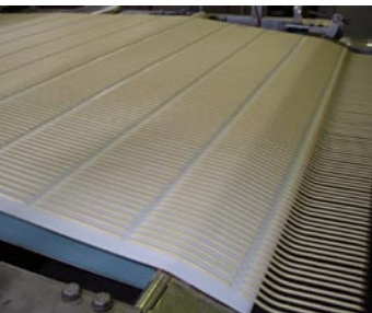
HP belts for the production of snacks with presence of aggressive vegetal oils