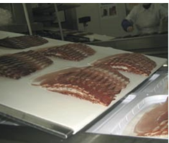
HP belts working on knife edges for sliced, cured meat processing