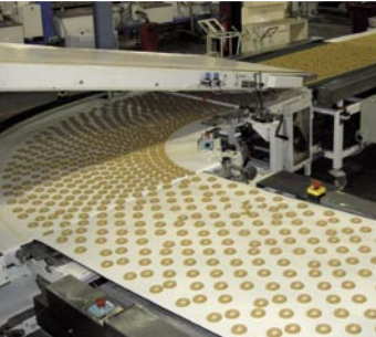
HP belts linear or for curve conveyors (also inclined)