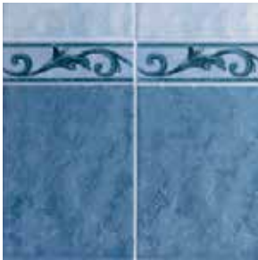
Printing flaws due to irregular belt feed